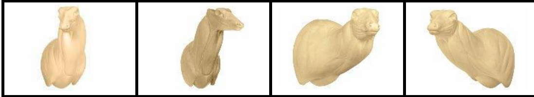
Right Alert Upright