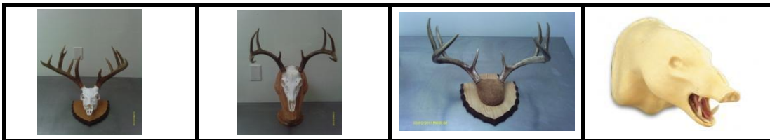
European Wall Mount